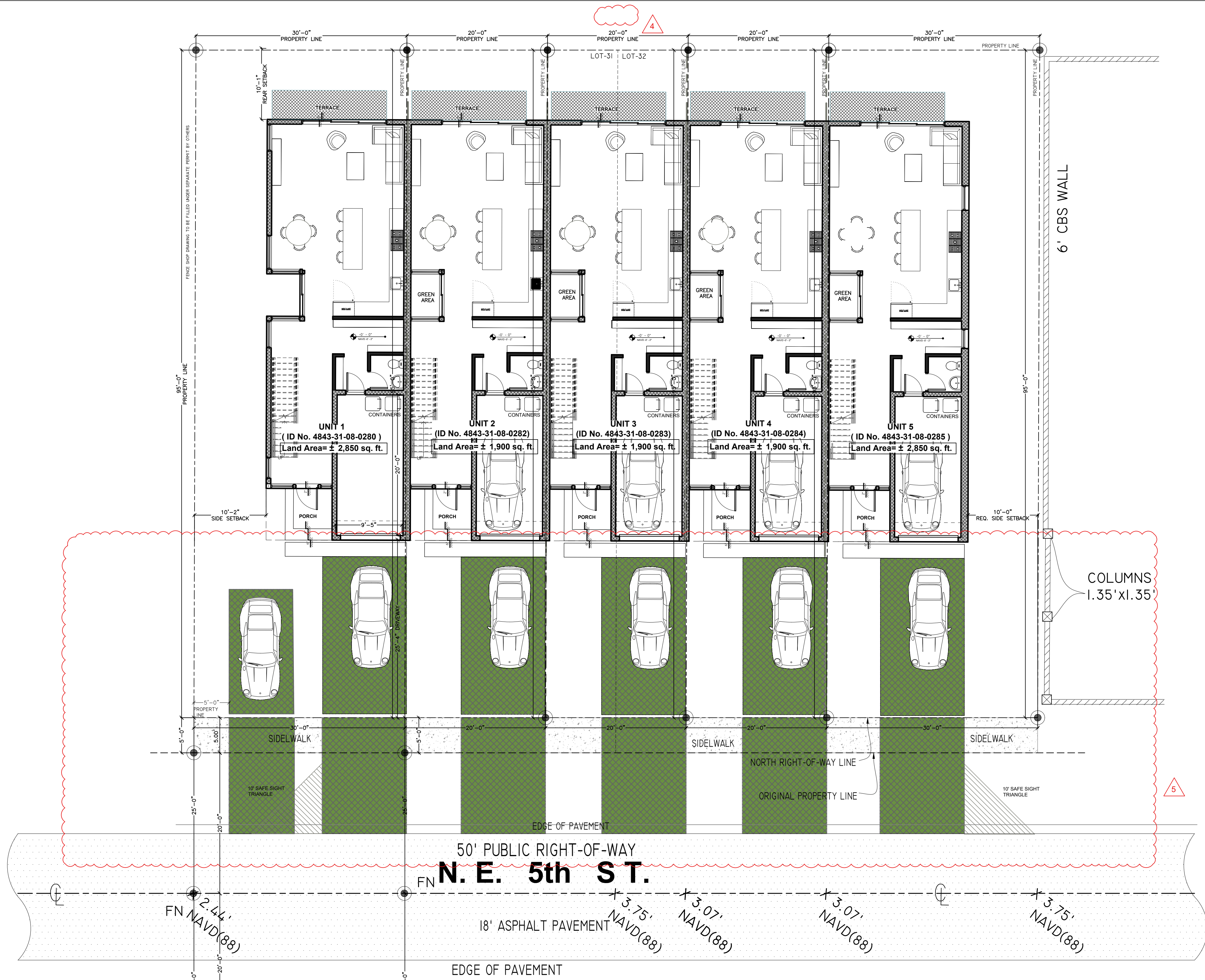
1 SITE PLAN 1/8" = 1'-0"